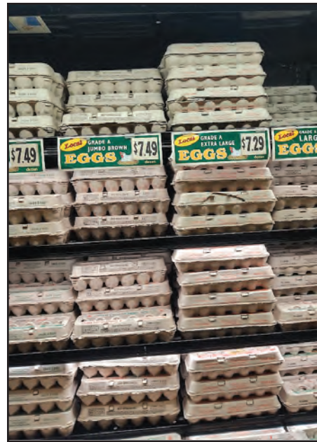
Are your eggs local?

• Vegetarian Fed - The hens are fed a vegetarian diet. This is tough for pasture-