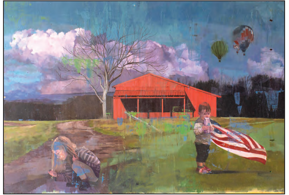
The Cunneen-Hackett Arts Center in Poughkeepsie hosts three new art exhibits in its Visual Art Galleries.

The Victorian Gallery at 9 Vassar Street is open Monday through Friday from 9 a.m. - 5 p.m. The Hancock Gallery and Reception Gallery at 12 Vassar Street are open Monday through Friday from 9 a.m. - 5 p.m. but visitors must call the Cunneen-Hackett Arts Center Office at 845-486-4571 for access. The 12 Vassar Street Galleries are also open during events at the VBI Theatre.