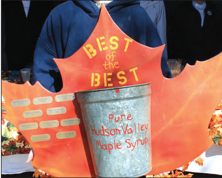
The Fresh Air Fund's annual Sugar Maple Celebration will be held at Sharpe Reservation in Fishkill on March 25.