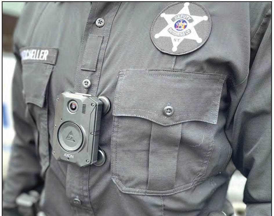
Body-worn cameras will be in use when Sheriff's Deputies respond to incidents or take official action.