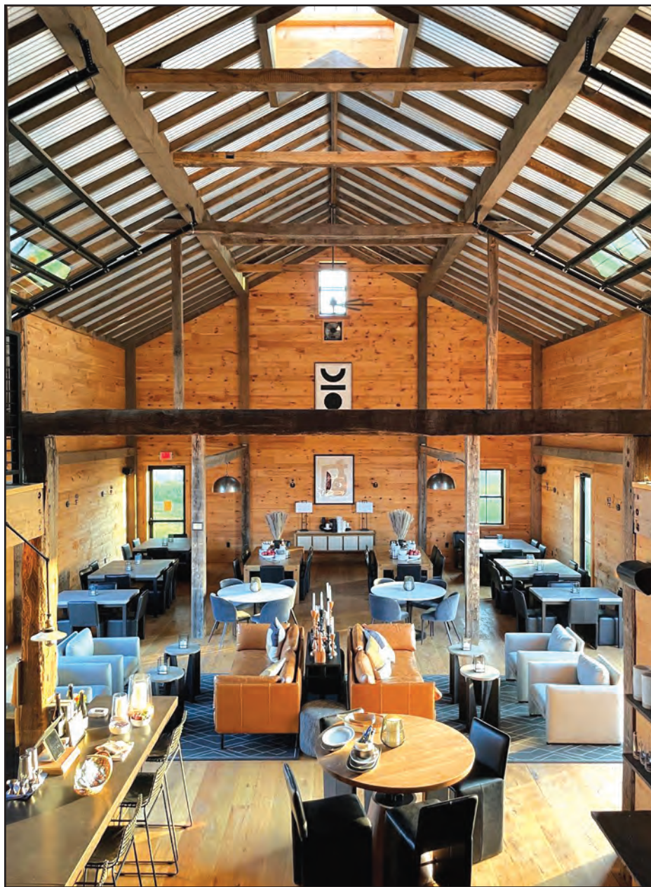
The tap room at Rose Hill Farm in Red Hook is where attendees of the April 14 Tavern Trail event will hear Prohibition stories from Red Hook while enjoying local beverages and cuisine.