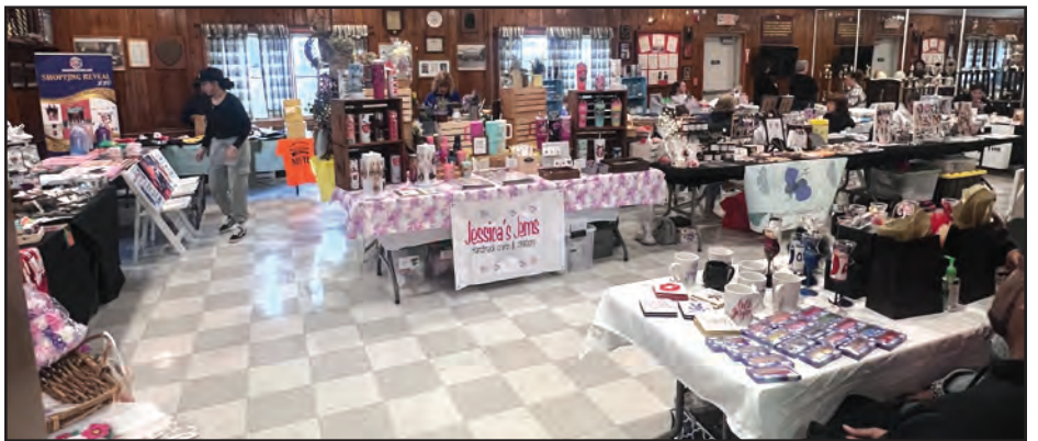
A Spring Craft Fair will be held by the Slater Chemical Auxiliary at the Slater Chemical Firehouse, 72 Old Glenham Rd., from 10 a.m. - 3 p.m. on Saturday, April 26. There will be vendors with a variety of wares. The Slater Chemical Fire Company will also be hosting a RecruitNY for people to find out info and learn as well as applications to join.