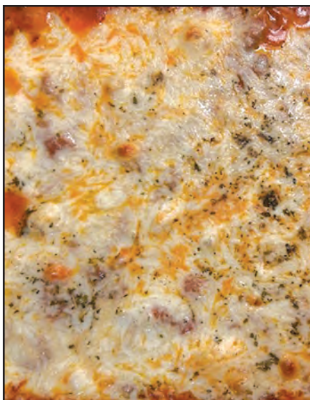
Spaghetti Casserole - a cheesy dish to cook this spring.

Preheat oven to 350 degrees. Cook spaghetti according to package directions. (I add it to boiling salted water and cook about 8 minutes for al dente.) Drain and return it to the pot. Lightly beat the eggs and add them to the pasta. Add cottage cheese, cream cheese and Parmesan and give it a good stir to coat the spaghetti. Season