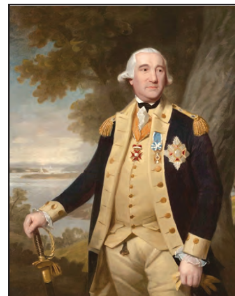
Mount Gulian will celebrate its 50th year as a historic site in 2025. The new season begins on April 27.