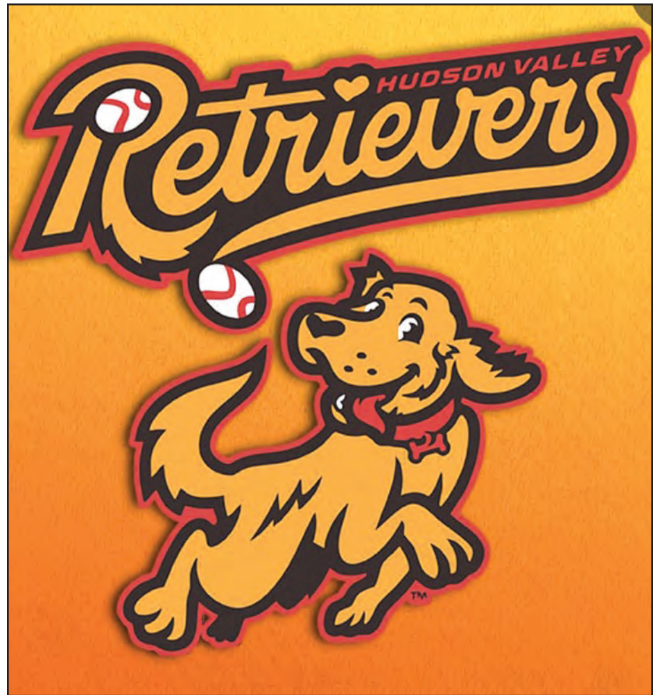
Some of the 2025 alternative identities for the Hudson Valley Renegades will be, from top left, Cider Donuts, Retrievers and Big Apples.

Even cat people are raving about this one. The heart dotting the "i" doesn't even compare to my love for this identity. The tail-crossed "t", even better. The Retrievers identity will debut on Sunday, June 15, which is Father's Day and Family Fun Day all in one. Surely there will be some real-life retrievers in atten-