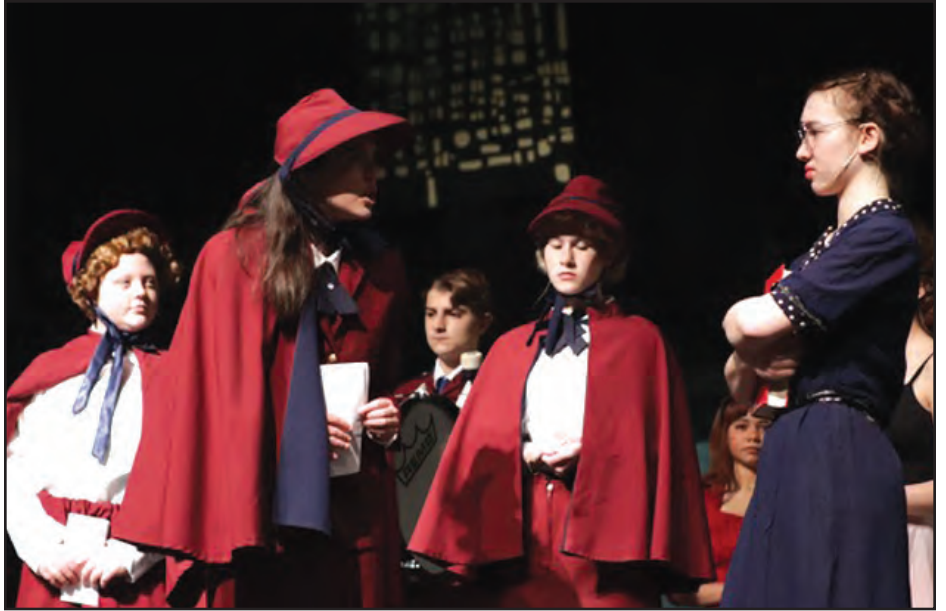
The Beacon Players will perform "Guys & Dolls" at Beacon High School from April 25-27.