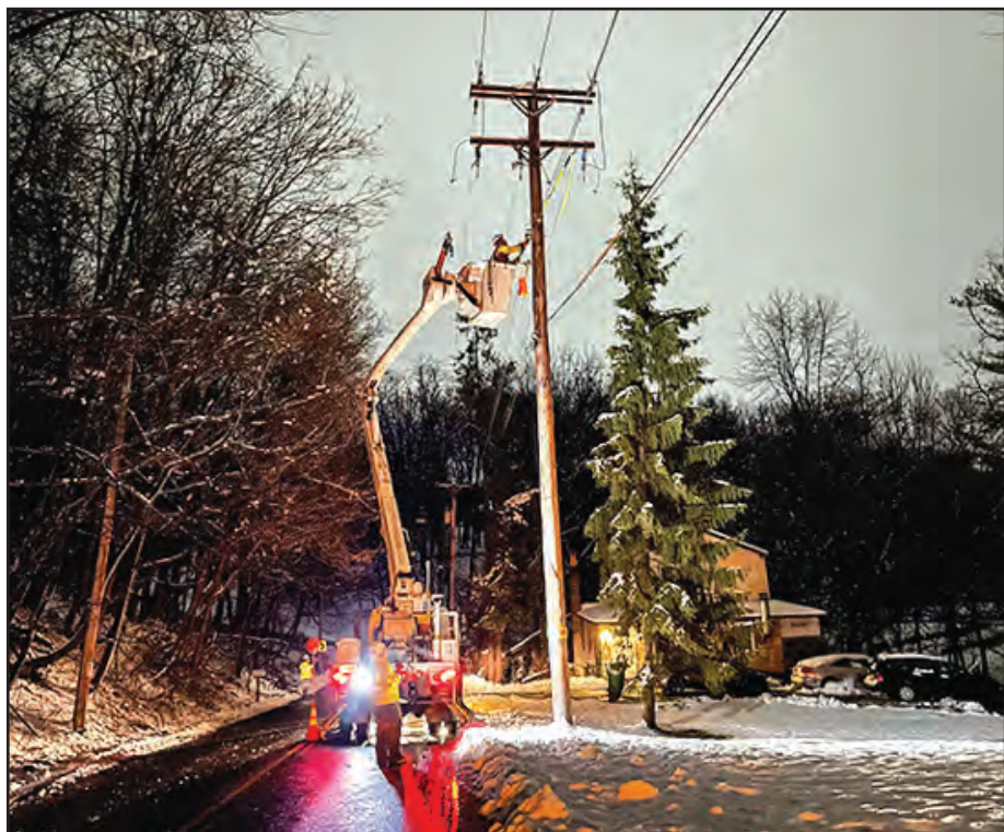
Central Hudson lineworkers repair damage during a previous snow and wind storm. National Lineman Appreciation Day was April 18.