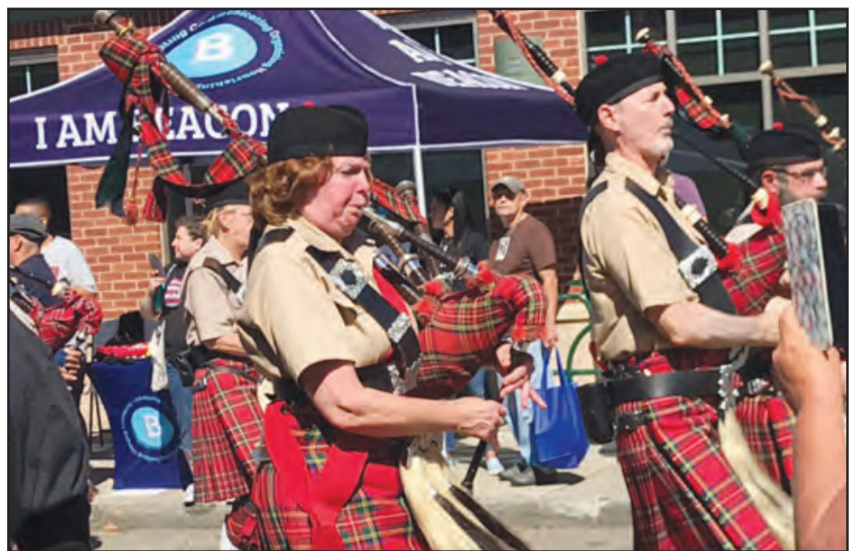
The Spirit of Beacon Day parade will take place on Main Street on September 24. Bagpipers participate in a previous year's event.