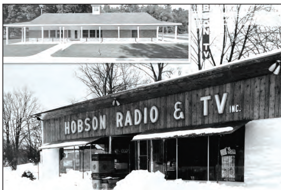
Bottom: The building at 6282 Route 9, Rhinebeck, known for over half a century as Hobson's Radio & TV, has been carefully crafted for site-sensitive adaptive reuse as the headquarters of the Dutchess County Historical Society's libraries and archive.