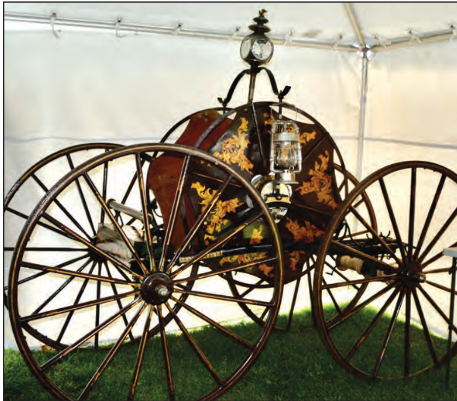
The Dutchess County Firefighting Museum will again have a historic display at the Dutchess County Fair. This year they will have a Millerton Fire Department 1892 Hose Cart, pictured above, Pine Plains Fire Department 1899 Ladder truck, Rhinebeck's 1859 Hand Pumper (Old Pokie). The Texaco 1955 2nd edition pumper that served the Texaco research center in Beacon will also be included, plus many other artifacts that go back to early 1900s. So be sure to stop by and say hello.