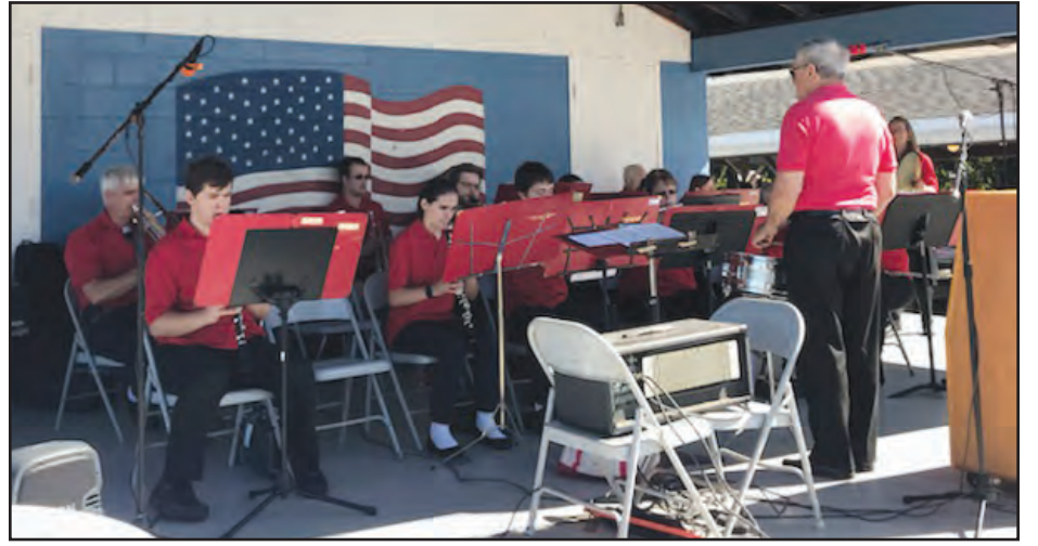
The Hudson Valley BSA Community Band is seeking musicians.

The band meets every Sunday night unless a concert is scheduled for that day or night or canceled. The band meets at the East Fishkill Community Center, 890 Route 82, in East Fishkill, from 6:30-8:30 p.m.