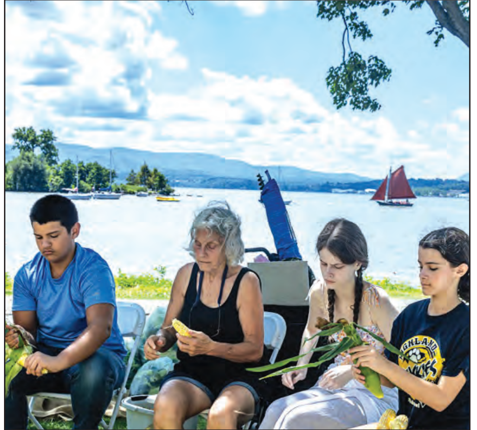
The Beacon Sloop Club held its annual Corn Festival at Pete & Toshi Seeger Park earlier this month. Attendees were entertained by different musical performers and, of course, were able to enjoy the locally grown corn.