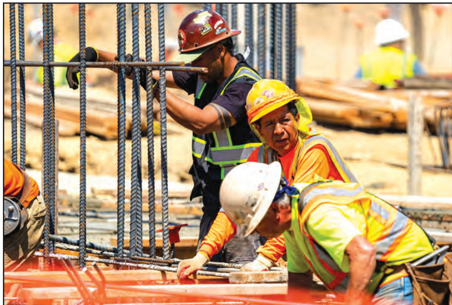
Workers begin construction on the "Phase Two" renovations at Heritage Financial Park, home of the Hudson Valley Renegades minor league baseball team. All construction is slated to be completed by opening day of April, 2024.

For games, the Renegades will sell season-long memberships, group tickets, and a limited number of single-game tickets for the club. Inside, the club will feature a full-