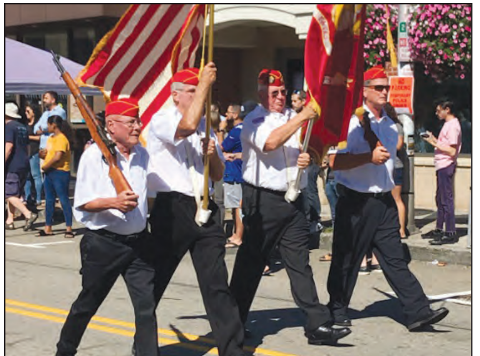
The annual Spirit of Beacon Day will take place on September 24. The theme is "Level Up."