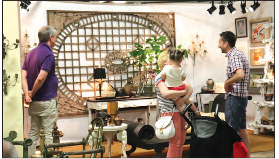
Fall Antiques at Rhinebeck returns to the Dutchess County Fairgrounds in Rhinebeck on Saturday, Oct. 7 and Sunday, Oct. 8.