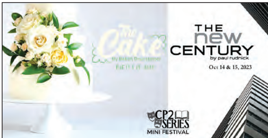
County Players will present "The Cake" and "The New Century" in Wappingers Falls October 13-15.