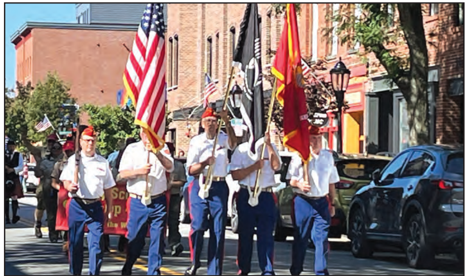
Spirit of Beacon Day was held on Main St. on October 1, after being rescheduled due to weather from September 24. From top, members of the Hudson Highlands Pipe Band play the bagpipes and drums on their way down the parade route. Veterans carry flags. Members of the Beacon High School band entertain those along the parade route.