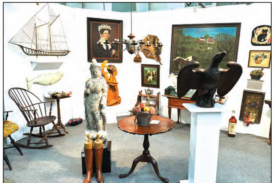
Fall Antiques at Rhinebeck returns to the Dutchess County Fairgrounds in Rhinebeck on Saturday, Oct. 7 and Sunday, Oct. 8.