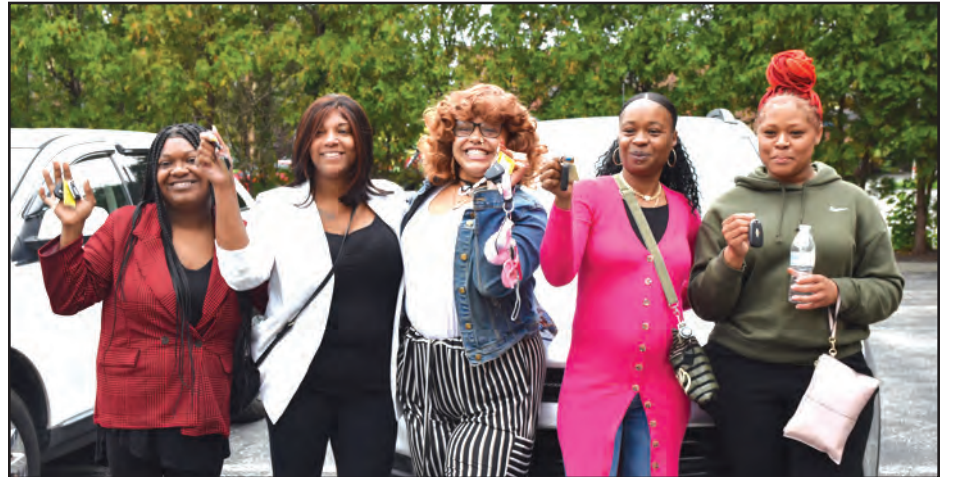
"Way to Work" program participants earned a gently used vehicle to help them obtain and retain employment, acquire jobs with more hours or higher pay, gain access to higher education, increase their wage potential and take their children to and from school. Five local recipients earned vehicles on September 28.