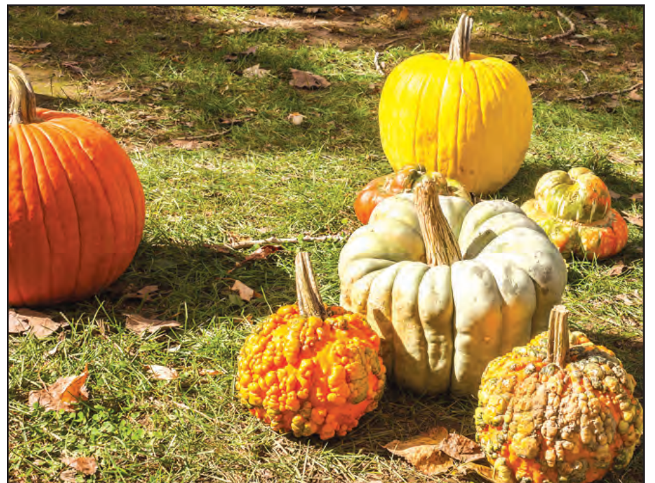
The annual Pumpkin Festival will be held at Pete & Toshi Seeger Park in Beacon on October 15.