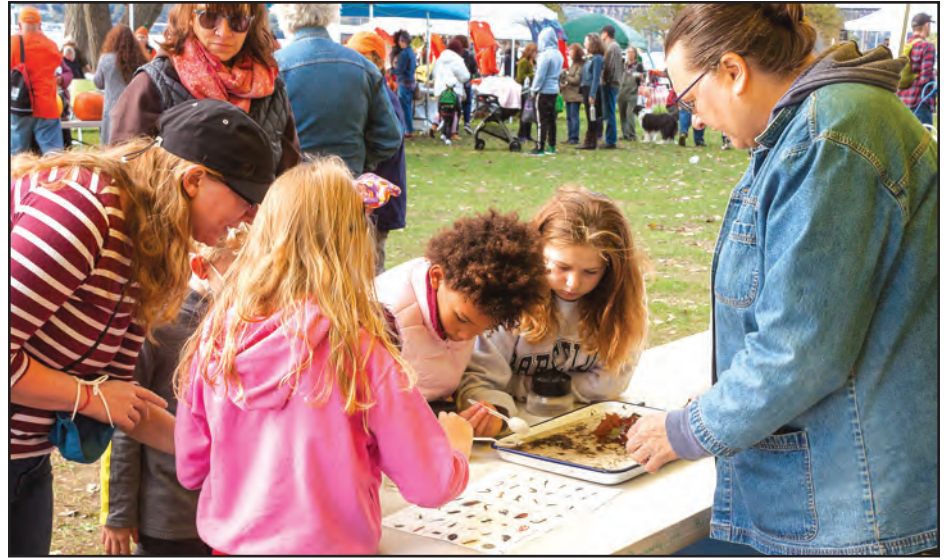
There will be a variety of musical entertainment (left) and environmental projects during the Pumpkin Festival on October 15 at Pete & Toshi Seeger Park in Beacon.