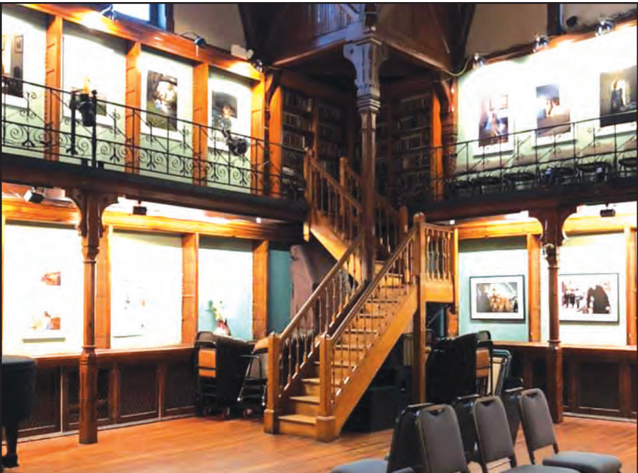
Howland Cultural Center’s main gallery will be renamed Northcutt Hall on October 30th in honor of longtime volunteer Florence Northcutt.