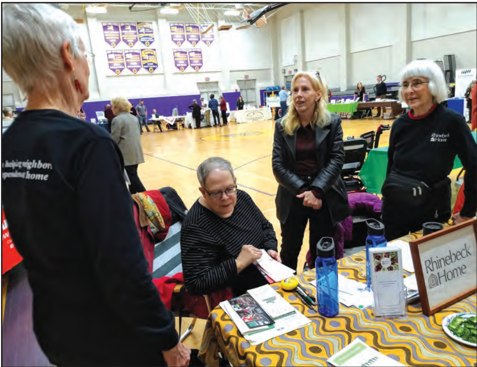
‘Thriving in Rhinebeck’ returns on October 22. Pictured are attendees and vendors from the 2019 event.