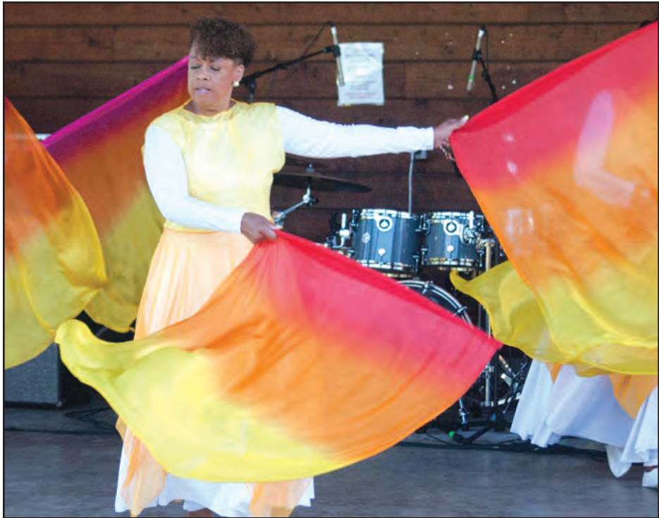
The Hudson Valley Gospel Festival will be held on October 22 in Poughkeepsie.