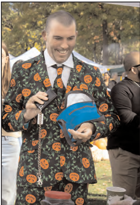
The Beacon Sloop Club held its annual Pumpkin Festival at Pete & Toshi Seeger Park on October 16. Pumpkin pie, and pumpkin outfits, were the orders of the day if one chose. Attendees to the event had the chance to be entertained by a variety of performers.