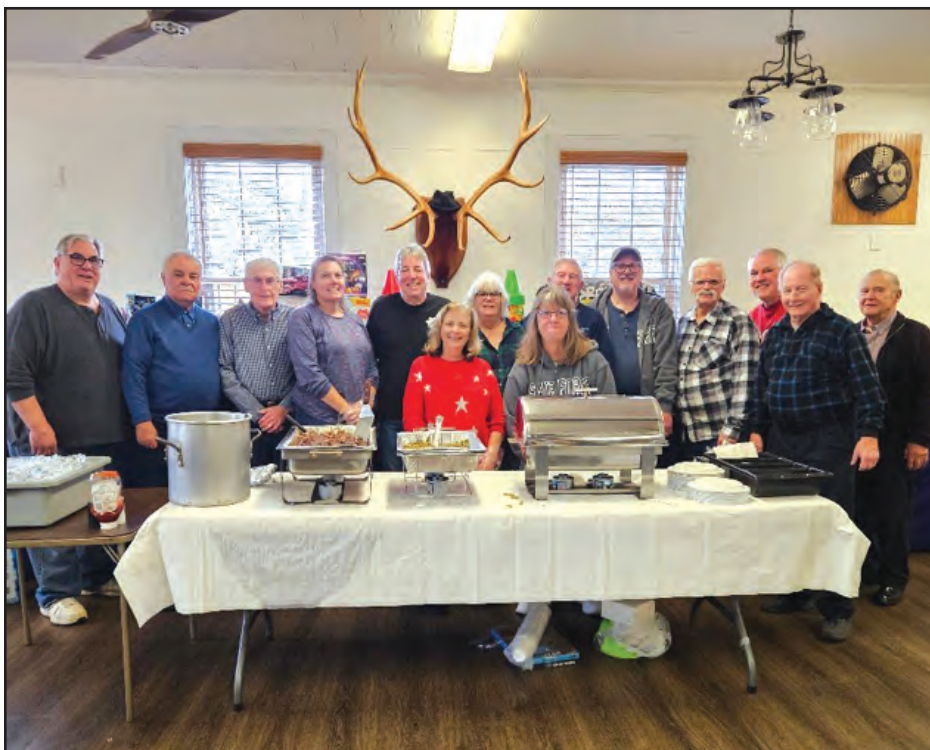
The Beacon Elks Lodge #1493 held a luncheon for local Veterans at the lodge. Seventy local Veterans and their relatives and friends attended the luncheon. The luncheon was provided by the lodge with the use of an Elks National Foundation Freedom Grant.