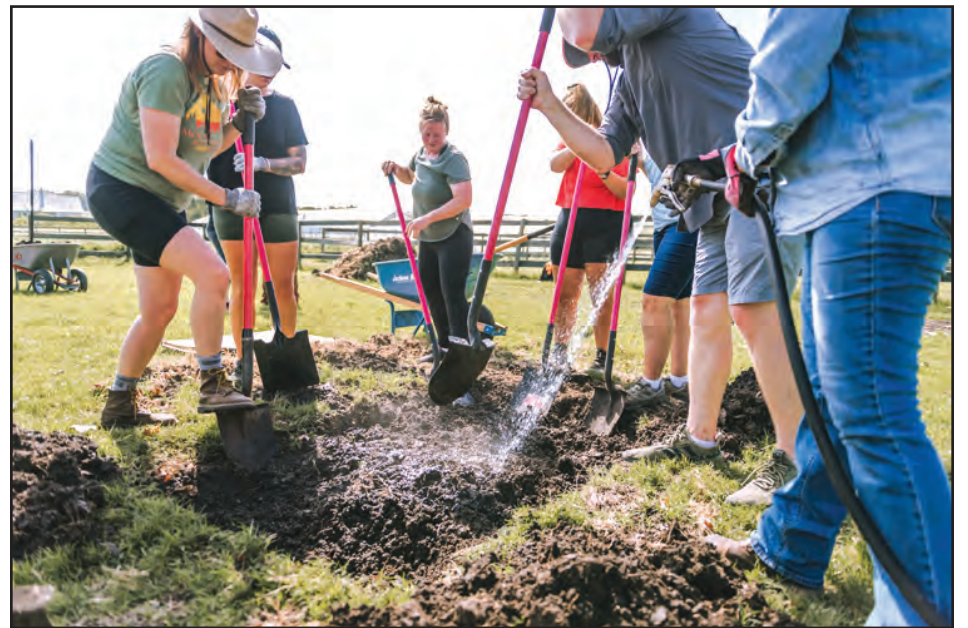
Participants at a Fearless Farmers Intensive participate in a hands-on soil demonstration. A participant at a Fearless Farmers Intensive takes a "sit-spot" moment in nature for reflection and observation.

Accommodations and food are included in the registration fee. Reach out with questions at info@fearlessfarmers.org .