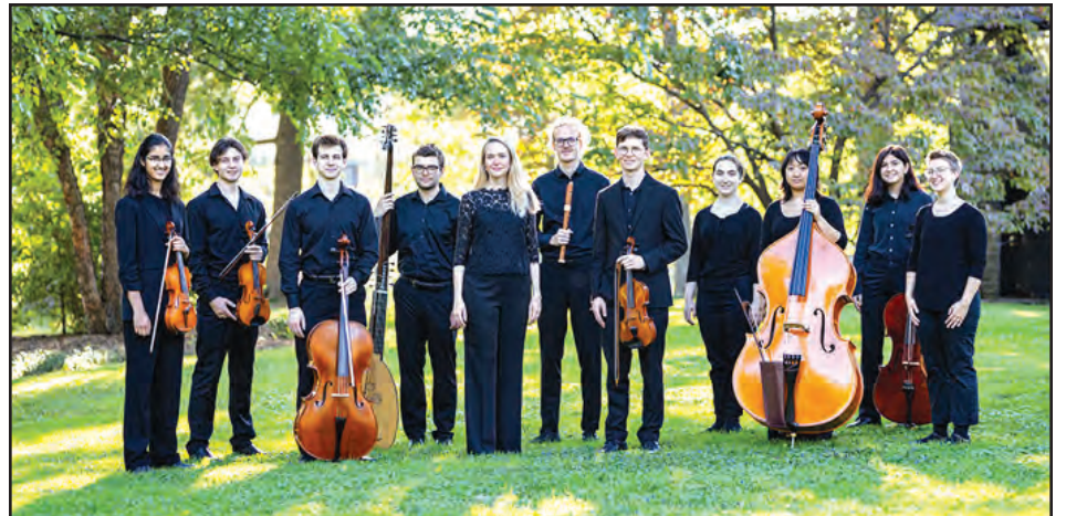
Bard Baroque Ensemble.