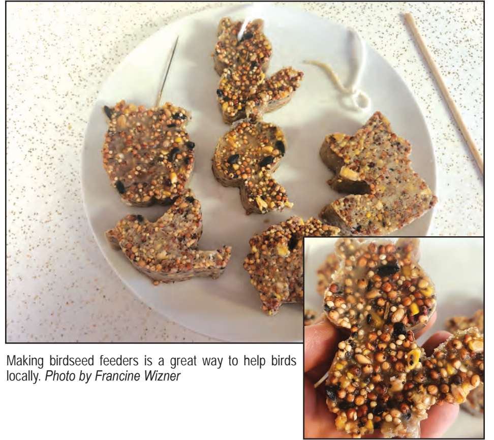
Making birdseed feeders is a great way to help birds locally.