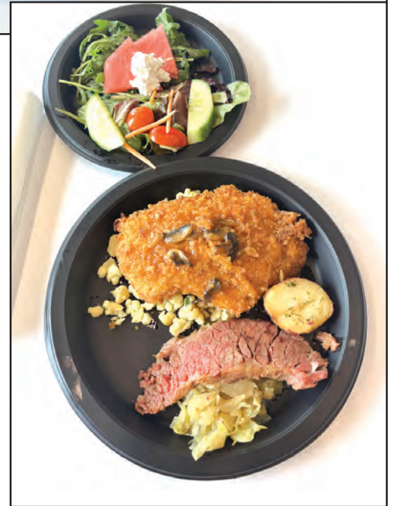
From Jägerschnitzel to Corn Beef sandwiches to salads and Carrot cake desserts, the chefs at Heritage Financial Park will have a variety of new treats for Renegades fans this season.