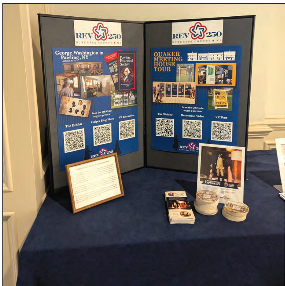
The Dutchess Rev250 Trade Show Display at “A Common Cause to All,” the national America250 Summit in Williamsburg, Virginia, in March 2025.