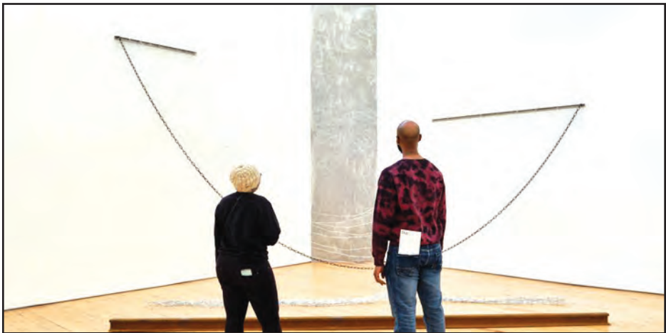
Midsummer Evenings take place at Dia Beacon July 23. Midsummer Evenings is a series featuring extended visiting hours in the galleries and unique wine and dining options in the café until 8 p.m. Reserve tickets at tickets@diaart.org or 845-231-0811. Dia Beacon is at 3 Beekman St. in Beacon.

For more information, visit www.diaart.org or www.facebook.com/diaartfoundation/ .