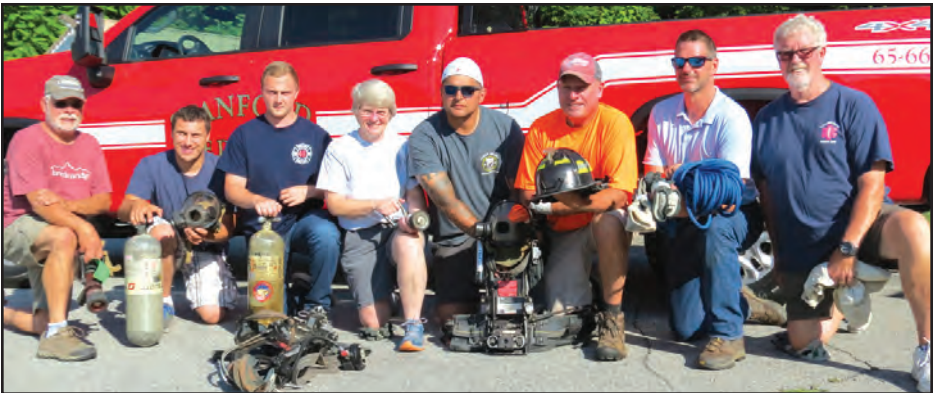
Members of the Town of Stanford Fire Department are collecting items from area fire departments to ship to firefighters and first responders in Ukraine.