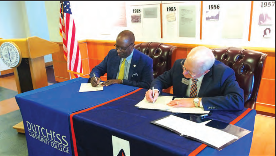
Dutchess Community College (DCC) and SUNY New Paltz leaders recently signed an agreement to streamline the process for students who attend DCC to transfer to SUNY New Paltz.