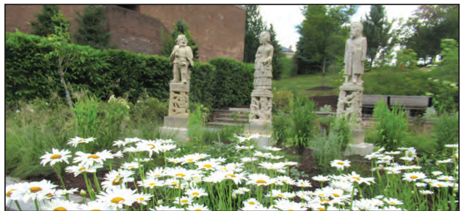
Clockwise from top left, Rose at Huntington Gardens. A rose at Vassar College. The Vassar College Shakespeare Garden.