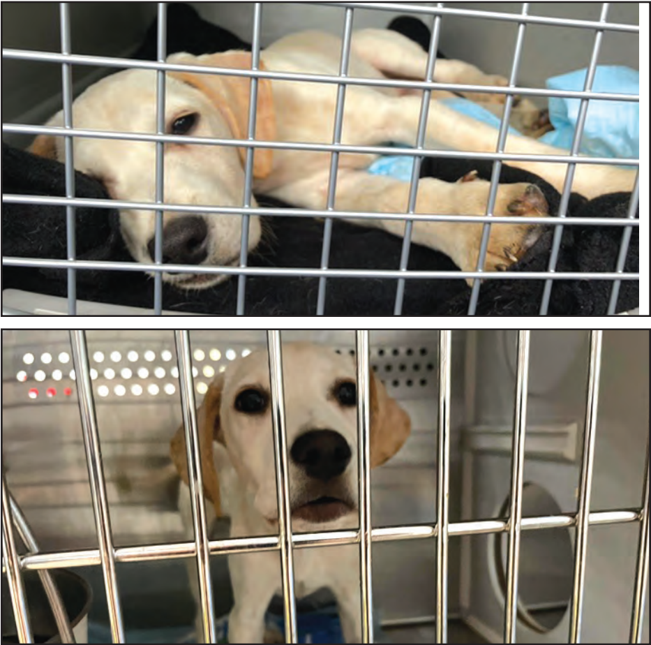
Marley, a 4-month-old puppy rescued by the Dutchess County SPCA, is being treated for parvo virus, a life-threatening disease. He is the only survivor of six puppies suffering from parvo who were recently brought to the shelter. As of last week, Marley was recovering. Donations are requested to help defray costs of Marley’s treatment, which have exceeded $5,000. The top photo, taken around July 6, shows a sick Marley lying in his crate. In the bottom photo, taken this past week, he is looking much more lively.

pies in public places in Dutchess and Ulster counties. “The puppies are ill—many have died of parvo which is highly contagious,” the alert stated. “These puppies are in need of urgent veterinary care, and should not be purchased.” An investigation by the DCSPCA is currently under way. “Never purchase a puppy from a stranger in any public space. Anyone selling animals this way is not making money because they have invested in these puppies’ care,” the alert continued. “Puppies will frequently have been taken from their mother too soon, will often have genetic or contagious conditions, and have never received veterinary care. The cost of care these sick animals will require far outweighs the cheap purchase price.” DCSPCA reported that some of the sick puppies were brought to the shelter by distraught owners. Two of them were rescued from a pond where they had been dumped. “We did all we could for them, but sadly they were too far gone to be saved,” the organization posted on its Facebook page. According to the Cornell University