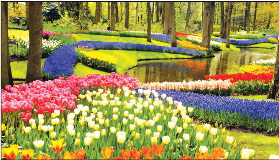
Keukenhof is one of the largest botanical gardens in Amsterdam and is likely in the top category of all European gardens.

mal and can sometimes seem a little stiff. But, the majority of homes have more free flowing forms of floral decoration either in their yards or in window boxes. The locals take great pride in keeping their small gardens neat and appealing and the flowers wish you "welcome" as you approach the door front. One of the best European floral parks (aside from Versailles) is in Amsterdam. I have had the pleasure of visiting Keukenhof in Amsterdam. Keukenhof is one of the largest botanical gardens in Amsterdam and is likely in the top category of all European gardens. I was surprised to learn that many European countries also grow Sunflowers. While it's not native to Europe, those with the most growing acreage for Sunflowers are Spain and France, and surprisingly, Romania, Hungary, and Bulgaria! Collectively, these countries produce more than 90 percent of the entire European Union acreage and sunflower production. As I was researching Sunflowers, I learned that there are a number of Sunflower fields in Dutchess County. In fact, there is a wonderful field in Poughkeepsie. I was intrigued and very eager to visit, especially since dogs were welcome. I packed up my favorite canine, Petey Boy, and with his head and tongue hanging out of the window, off we went. We heard the music before we reached