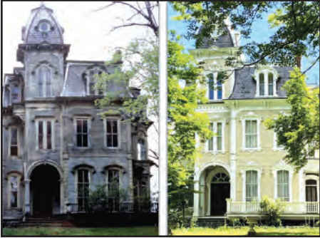
A private home today, the Ambrose Wager house in Rhinebeck was restored in the 1980s. Built in 1874, its Second Empire style is inspired by the grand architecture of France at the time.

"I see that some, at least, of you are of those who believe that an election being decided against them is no reason why they should sink the ship. ("Hurrah.") I believe with you, I believe in sticking to it; and carrying it through; and if defeated at one election, I believe in taking the chances next time. (Great laughter and applause.) I do not think that they have chosen the best man to conduct our affairs, now--I am sure they did not --but acting honestly and sincerely, and with your aid. I think we shall be able to get through the storm --In addition to what I have said I have only to bid you farewell. (Cheers and a salute, amid which the train moved on)."